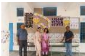
Rotary WinS Project successfully completed at Govt. Sr. Sec School, Bajghera, Gurgaon