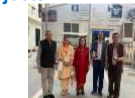
Donated 900+ garments to Earth Saviour Foundation