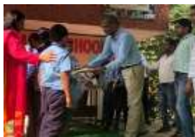
School 1 - Government Model Primary School, Sushant Lok-I, Gurgaon