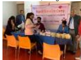
HDFC Bank, Sector 10 & Sector 53, Gurgaon