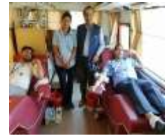
RKF Technologies, Manesar