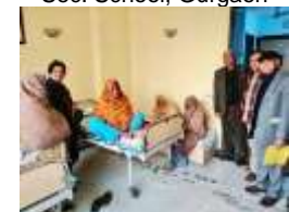
Cataract Surgery camp at Arunodaya Deseret Eye Hospital