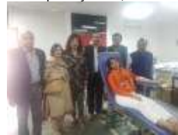
Ansal University Sector 55, Gurgaon