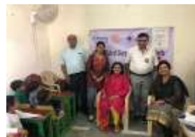
School 3 - Pre-School run by a NGO Kota Intl., Gurgaon