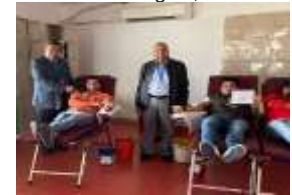
NTT Data Services Sector 65, Gurgaon