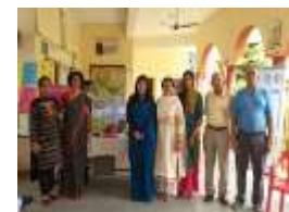
Installation of Sanitary Napkin Vending Machine at Govt. Model Sanskriti Sr. Sec. School, Gurgaon