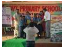
School 2 – Govt. Model Sanskriti Primary School, Sushant Lok-I, Gurgaon