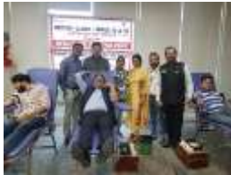
Keysight Technologies Manesar