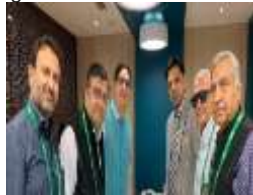
Boston Scientific Tech. & Engg. Services, Gurgaon