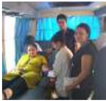
VVDN Technologies, Gurgaon & Noida