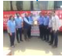
Roop Polymers, Sohna